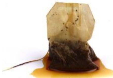
McAuley decided 100 tea bags was enough for the weekend, so we are now out of tea. Well done Matt!!