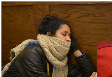
Sleeping on the job