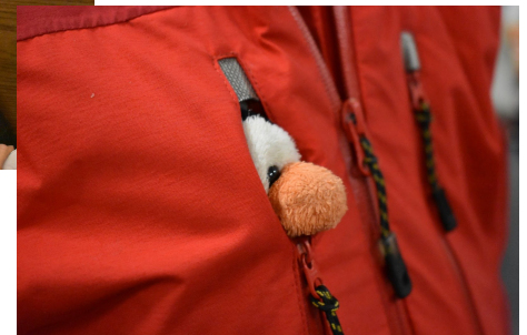
Penguin becomes nipple